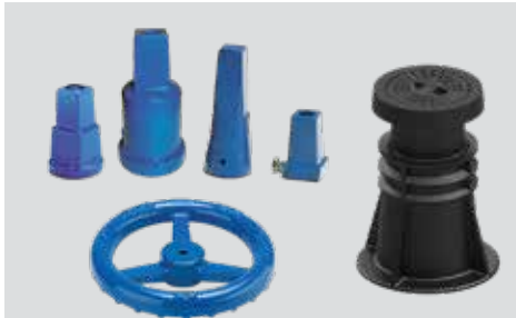
EXTENSION SPINDLE | SURFACE BOX | HANDWHEEL